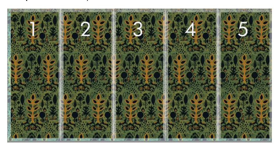
Maximum scale recommended

Example : Milles Fleurs / printed at max recommended scale / wall 2.5m tall x 5m wide.